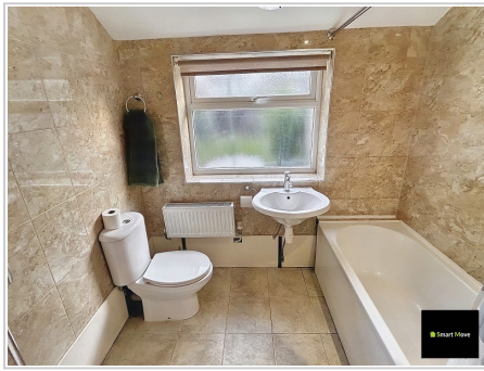
Bathroom (7' 2" x 5' 9") or (2.19m x 1.76m)

Three piece suite comprising of bath with electric shower above fully tiled, WC and wash hand basin with mixer tap, radiator, UPVC double glazed window to the rear