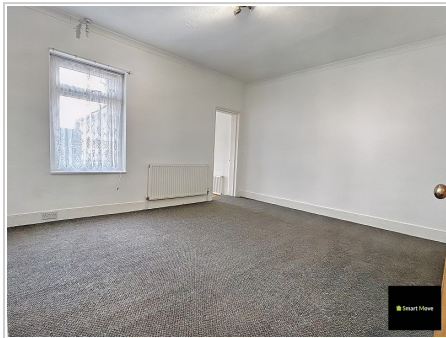
Bedroom 2 (14' 0" x 12' 7") or (4.26m x 3.84m)

UPVC double glazed window to the front, radiator, power sockets.