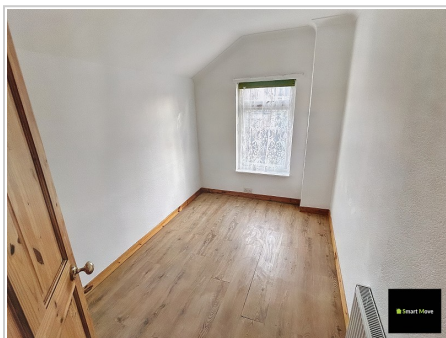
Bedroom 3 (7' 3" x 11' 3") or (2.20m x 3.44m)

UPVC double glazed window to the rear, radiator, power sockets.