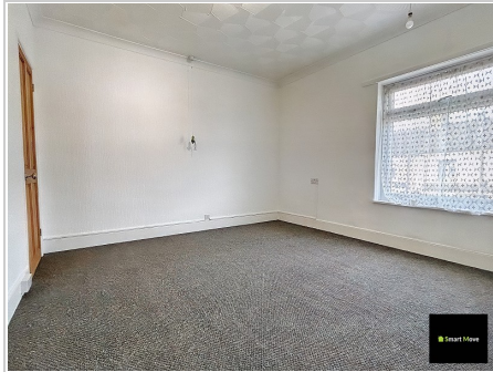
Bedroom 1 (13' 9" x 11' 5") or (4.19m x 3.47m)

Stairs leading to first floor and landing, light, carpeted.