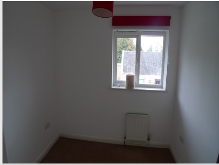
Bedroom 3 (7' 3" x 9' 4") or (2.21m x 2.84m)

Radiator, UPVC double glazed window to side.