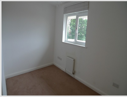
Bedroom 2 (10' 11" x 7' 3") or (3.34m x 2.21m)

Radiator, UPVC double glazed window to side.